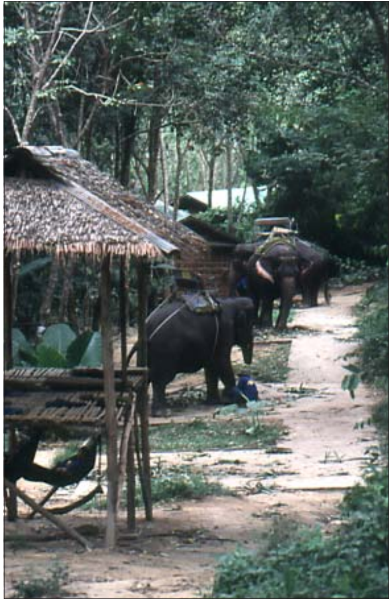
Some of Thailand's domesticated elephants live with their mahouts at camps such as this.