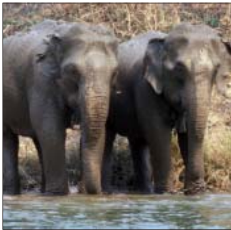
Elephants refresh themselves in the river's cool water.

The Thai elephant population has fallen from 100,000 a century ago to fewer than 5,000 today. Of these, approximately 2,000 still live in the wild.