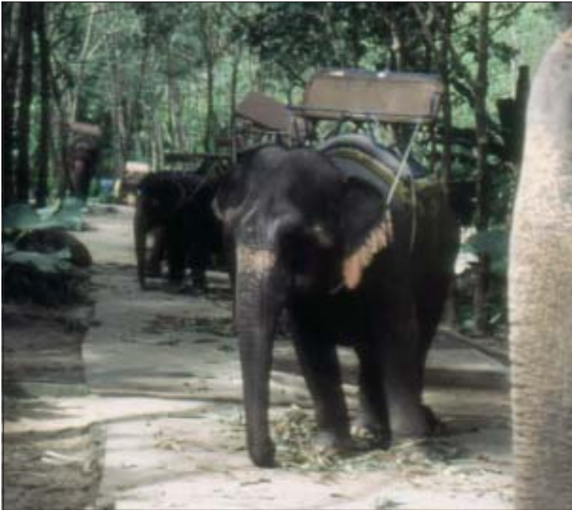
Saddled with howdahs, these elephants will carry riders on a trek through the jungle.

and-coming Lampang elephant orchestra and, more recently, elephant paper. Similar in characteristics to saa paper (which is made from the bark of mulberry trees), elephant paper is made from the fibrous waste of the elephant. Camps throughout the country look to the center for ideas to help support their own elephants.