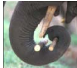
Today's elephants must depend on man for their bananas, sugarcane and grasses.

Elephants, herbivorous mammals, may eat as much as 250 kilograms of food a day.