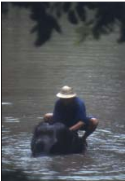
Mahout bathes his charge—a refreshing and enjoyable activity for both.

The Thai elephant needs to be protected and cherished if it is to continue to exist.