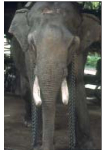
Once magnificent wild creatures, captive elephants sometimes require restraints.

Elephants, herbivorous mammals, may eat as much as 250 kilograms of food a day.