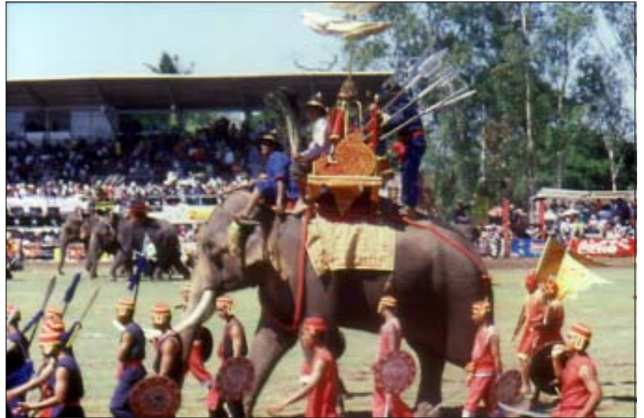
Elephants play an important role in the pageantry of historical presentations of Thai culture.

Sadly enough, the country is still losing elephants due to encroachment of farmers, poachers, illegal loggers as well as the dangers of begging in the cities. During the dry months when food is in short supply, the wild creatures come out of the forests to the lowlands to hunt for food, and subsequently damage the crops.