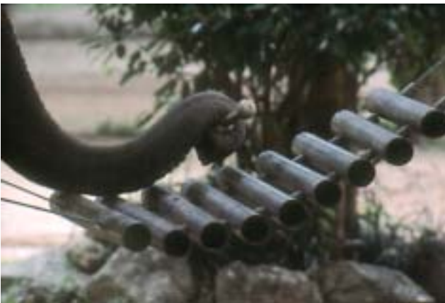
Some elephants have become quite adept as musicians; this one plays the xylophone with his trunk.