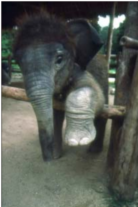
Taken from its mother by smuggler, this baby elephant is one of the charges at the conservation center.