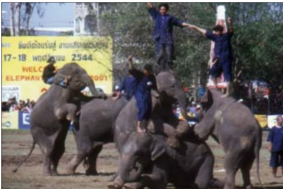
At the Surin Elephant Roundup, pachyderms perform a variety of acts.

The Thai elephant population has fallen from 100,000 a century ago to fewer than 5,000 today. Of these, approximately 2,000 still live in the wild.