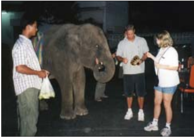
Under the watchful eye of the mahout, tourists feed a baby elephant.

Angered farmers take the law into their own hands and kill the scavengers, whose only sin is hunger.