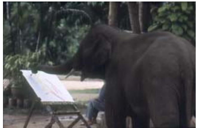
Paintings by elephants are sought after by tourists and collectors alike.